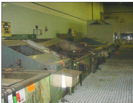
Fig. 1.1 Old waxing line