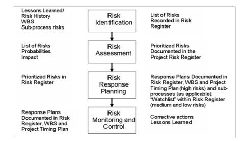
Fig. 1.2 Project risk management flow. OSSE-EP's procedure

The next figure shows the flow described in the current project risk management procedure.